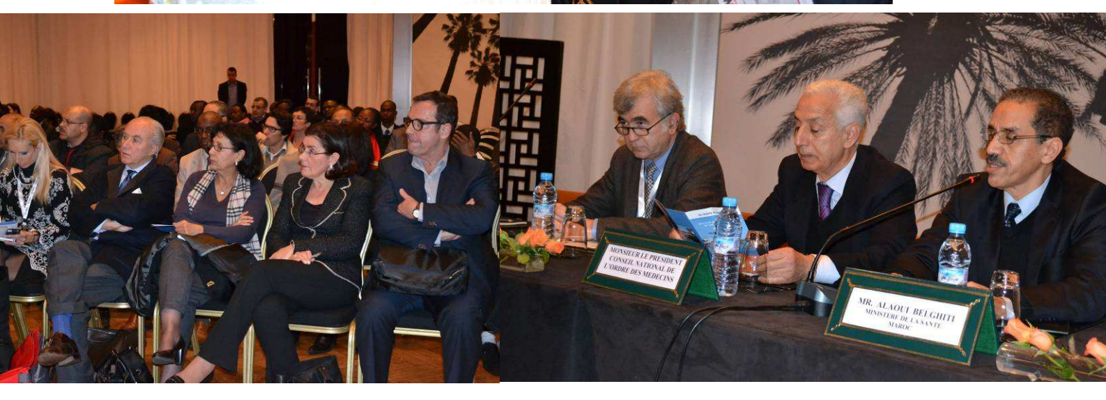
The 13<sup>th</sup> Annual Course (January 23 to February 2, 2014)