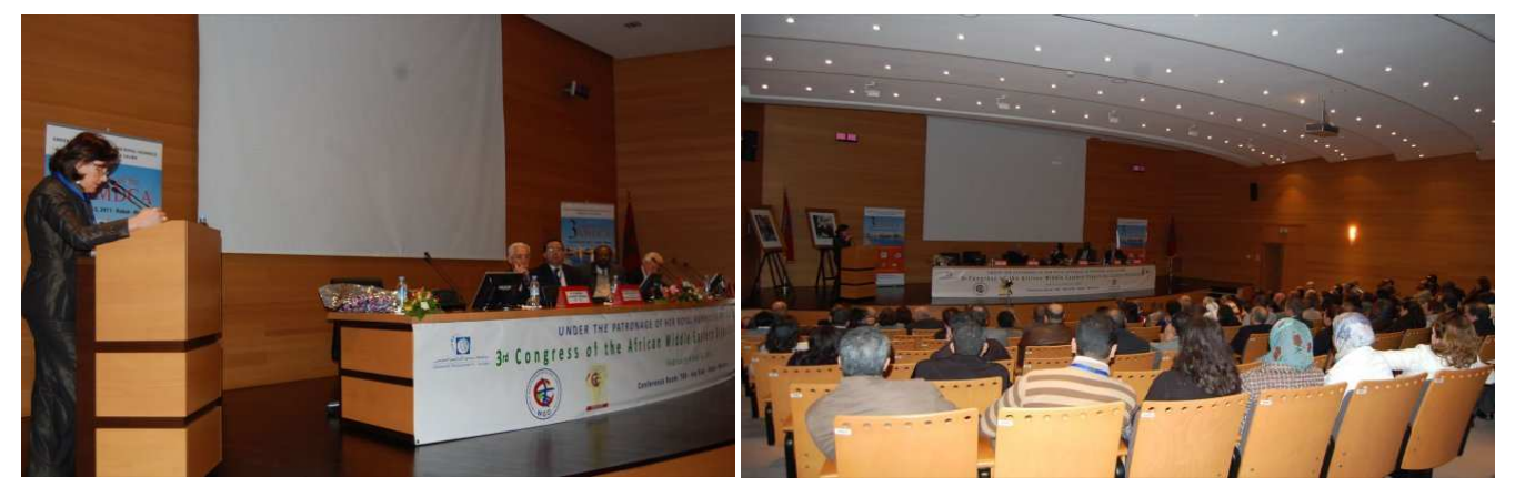
Above: Opening ceremony of the 3<sup>rd</sup> Conference of AMDCA

To celebrate the 10<sup>th</sup> Course with all the participants, we ended the Course with the 3rd African Middle Eastern Congress on Digestive Cancer, which was held on 4-5 February, 2011 in Rabat.