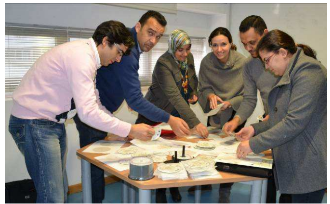
WGO-RTC Team preparing DVD & related documents