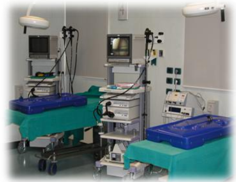
Radio-translucent tables with scalytic

All the courses are organized at the European Endoscopy Training Centre (EETC), Gemelli Hospital, Rome, Italy.