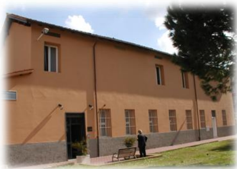
European Endoscopy Training Center

All the courses are organized at the European Endoscopy Training Centre (EETC), Gemelli Hospital, Rome, Italy.