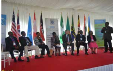
Nairobi Training Center opening ceremony.

program involved deductive lectures, 20 live transmissions, and hands-on training on basic and advanced upper GI endoscopy, colonoscopy, endoscopic ultrasound, and ERCP. The deductive lectures covered common clinical conditions in hepatology, pancreatobiliary, acid related disorders, and liver transplant.