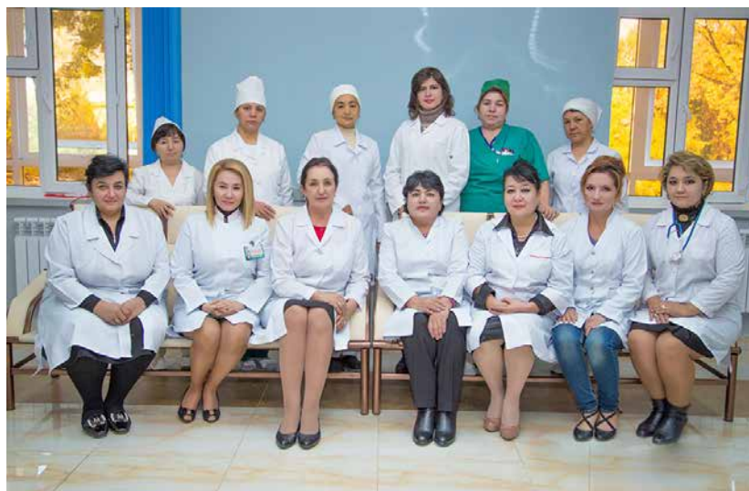
Members of the Society during the Annual Meeting break