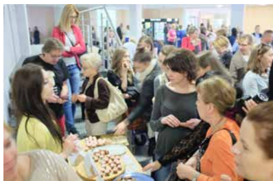
Medical practitioners dietitians, and general audience all enjoying the diet and the gut scientific conference.

plays on general health were reported. Special attention was made to the role of intestinal microbiota in celiac disease.