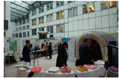
UEG Digestive Health and Children Exhibition in the European Parliament.