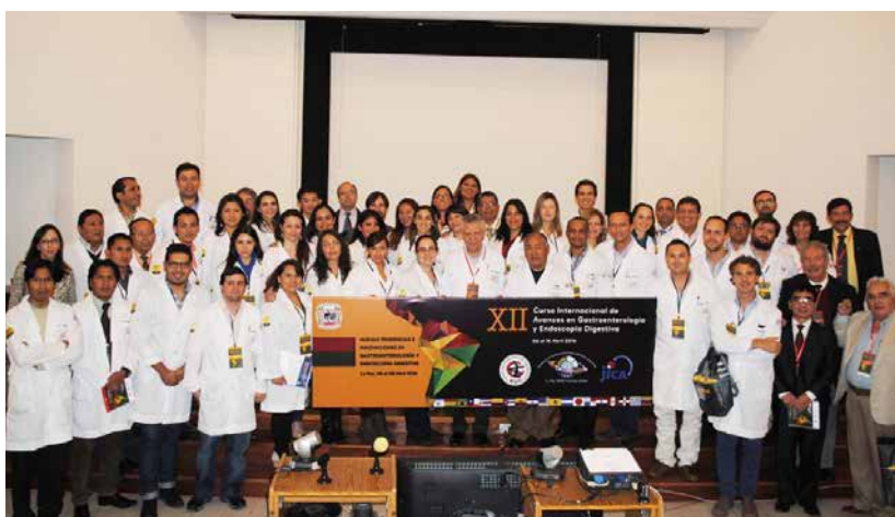
Trainees and professor in La Paz Course.

A total of 40 trainees were selected for scholarships. Between the trainees and professors, 19 countries were represented.