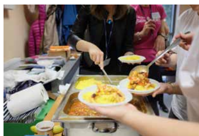
Attendees were invited to taste local gluten free and organic food.

efforts to distribute leaflets, posters, and messages through the internet, as well as social and public media. We also used our personal communication skills to convince the lay public where we live to attend this important WDHD event. Participants of the conference were invited to taste gluten free and ecologic food offered by local manufacturers. At the time of the conference several photographs were taken. We are looking forward to collaborating further with the World Gastroenterology Organisation for the purpose of bringing benefit to all our present and future patients.