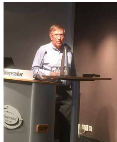
Professor Chapman, University of Oxford

The liver is continuously exposed to various antigens. While basically an immunotolerant organ, the liver's immunoreactivity is crucial for the elimination of harmful antigens. An imbalance between these two properties leads to autoimmune liver disease, partly dependent on genetic predisposition. Intestinal inflammation is associated with primary sclerosing cholangitis (PSC) (80% IBD), autoimmune hepatitis (AIH) (15% IBD), and primary biliary cholangitis (PBC)