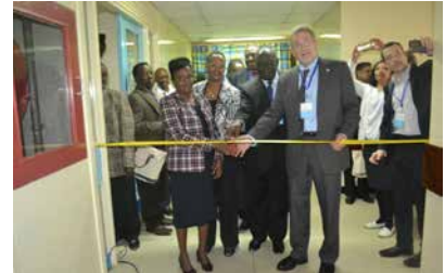
Ribbon cutting ceremony for launch of the Nairobi Training Center.