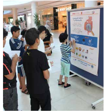
Kids enjoyed solving diet and gut quiz.