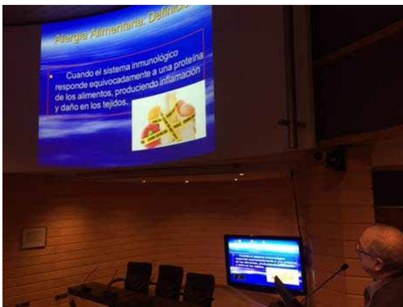
Felipe Finkelstein, MD presenting on Food Allergies

With these activities we have participated in and created awareness about World Digestive Health Day 2016 and especially on diets, foods, immunology, bacteria, and gastroenterological diseases.