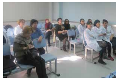
Members of the Society during the Annual Meeting of the Society of Pediatrics Gastroenterologists and Dieticians of Uzbekistan.

Gastroenterology of the Republican Specialized Scientific and Practical Medical Center of Pediatrics, told about the activities of the 23rd United European Gastroenterology (UEG) Week, including new methods to diagnose celiac disease based in presence of gluten peptides in urine. Then she told about how the gastroenterologists and pediatricians from different European countries follow the guidelines, based on the reports of