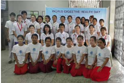
Yangon General Hospital, Myanmar Gastroenterology Family.