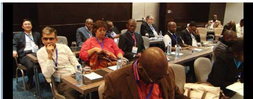
Inauguration workshop program at the Radisson Hotel.

The Training Center inauguration was part of a very successful two and a half day training workshop. The