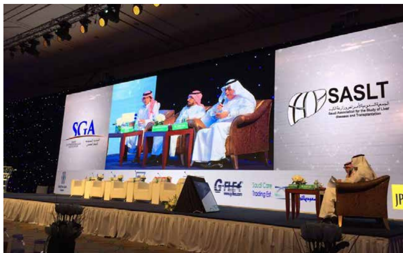
Some of the chairpersons of the SGA meeting.

The conference targeted regional gastroenterologists as well as internists, surgeons, radiologists, and researchers. The topics covered areas