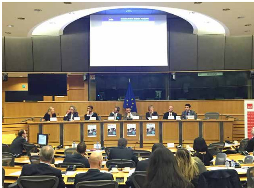
Panel Discussion at Prevention Promotion and Screening UEG Event in the European Parliament.

Participants agreed to support the sharing of best practices and will endeavor to continue raising awareness of the fact that screening programs are not yet implemented in all EU Member States. It was also agreed that the potential for a Written Declaration concerning pancreatic