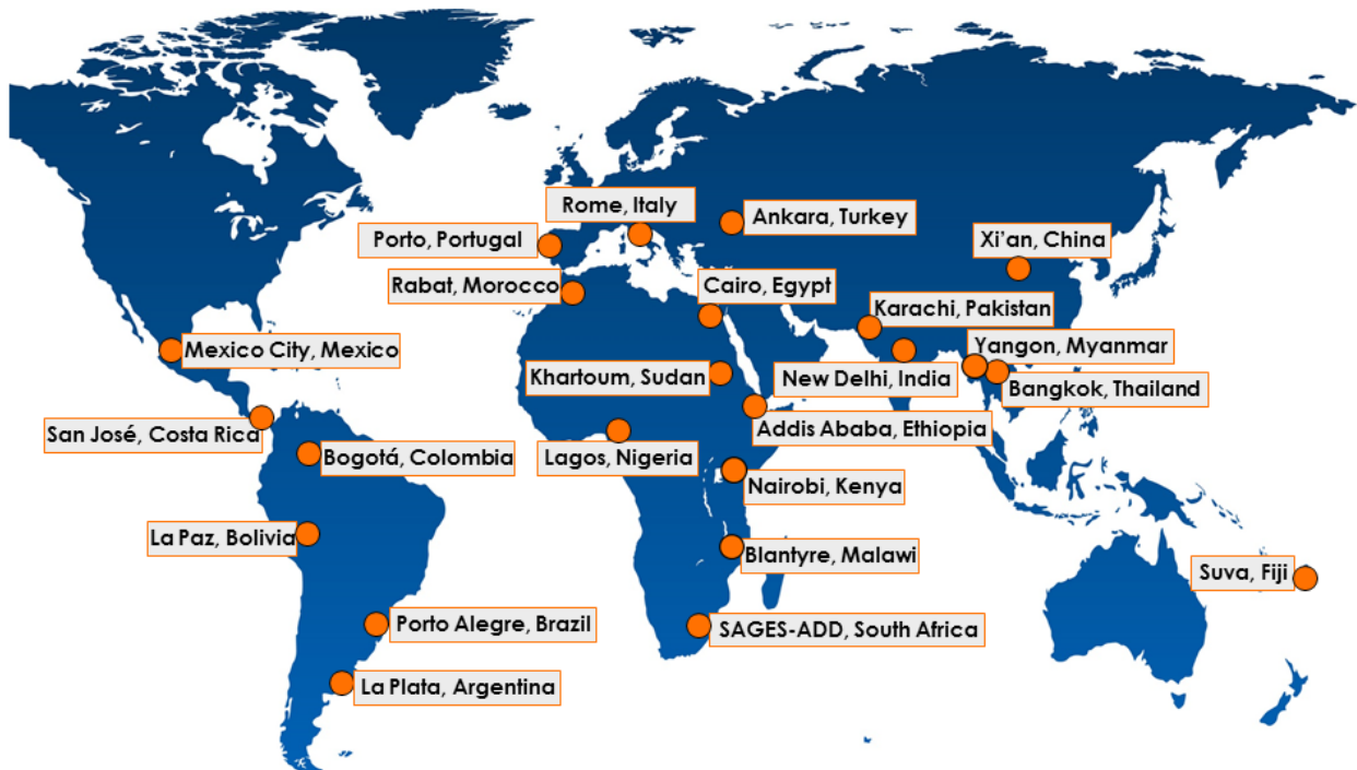
23 WGO Training Centers around the world.