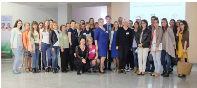
Faculty and attendees.

Our event gathered more than 340 participants to whom state of the art lectures were delivered. Leading scientists and medical practitioners of different scientific interests presented topics which revolved around interplay between diet and immune, neuroendocrine, and gastrointestinal systems. The outcomes of such inter-