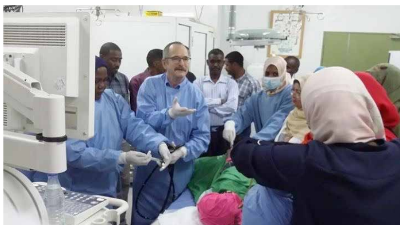
Hands on training.