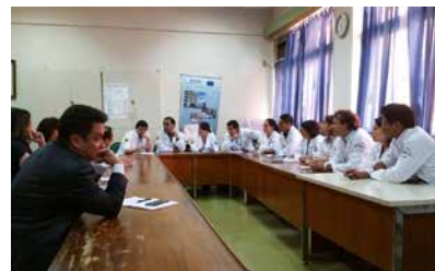
Latin American workshop of Viral Hepatitis B and C in Santa Cruz.

included roundtrip airfare from country of origin to Bolivia, lodging, travel expenses, domestic travel, health insurance, and teaching materials.