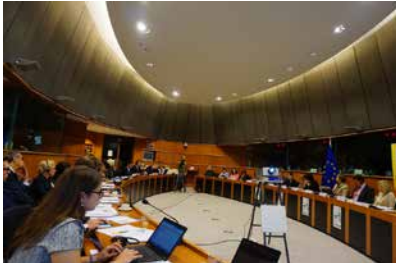
UEG Policy discussion on PIBD in the European Parliament with MEP Rivasi and various stakeholders."

cancer in 2017 should be followed-up. The European Cancer Organisation (ECCO) confirmed it will publish a report concerning quality assurance around the colorectal cancer screening guidelines by the end of 2016. The European Digestive Cancer Days 2017 in Prague, Czech Republic will serve as an important platform to continue discussions.