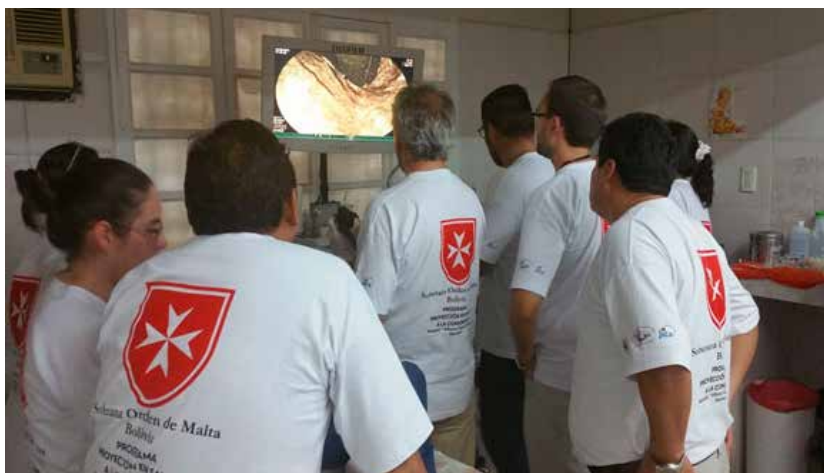
Endoscopy in Montero.

Objective: Present the scope of current Latin American specialist knowledge and development of central aspects of the specialty