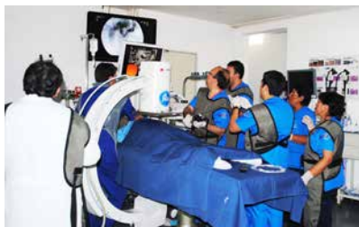
Live case in IGBJ La Paz.

through lectures, interactive seminars, workshops, and live case of therapeutic endoscopy, for which the following topics were selected: