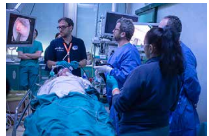
Treatment of Zenker's diverticulum

Worldwide experts and rising stars of the GI Endoscopy firmament are again part of the faculty of this new