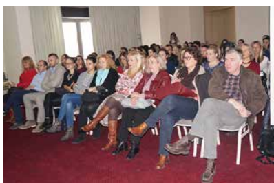
Attendees at the WDHD event

The Gastroenterohepatology Association of Montenegro celebrated World Digestive Health Day 2016, on 25 November. The theme was “Your diet in IBD and liver diseases”.