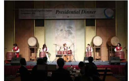
Traditional Korean music performance

The symposium provided an open forum for exchanging new information and ideas where participants from all over the world can have an opportunity to exchange new developments and recent research results in this field, as well as to promote fellowship. A total of 290 abstracts from were presented and discussed as oral or poster presentation by investigators from various countries. Among them, about forty participants received various prizes such as young investigator's