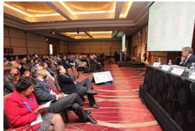
During the plenary sessions