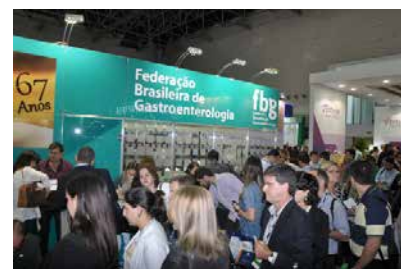
Exhibition area – Brazilian Federation of Gastroenterology