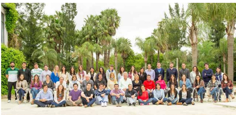
“Lobos” course participants

The 3-day course is very intensive (total of around 26 hours) and covers the entire spectrum of hepatology, from the very basic (liver tests, imaging, histopathology) to the more complex topics such as liver transplantation.