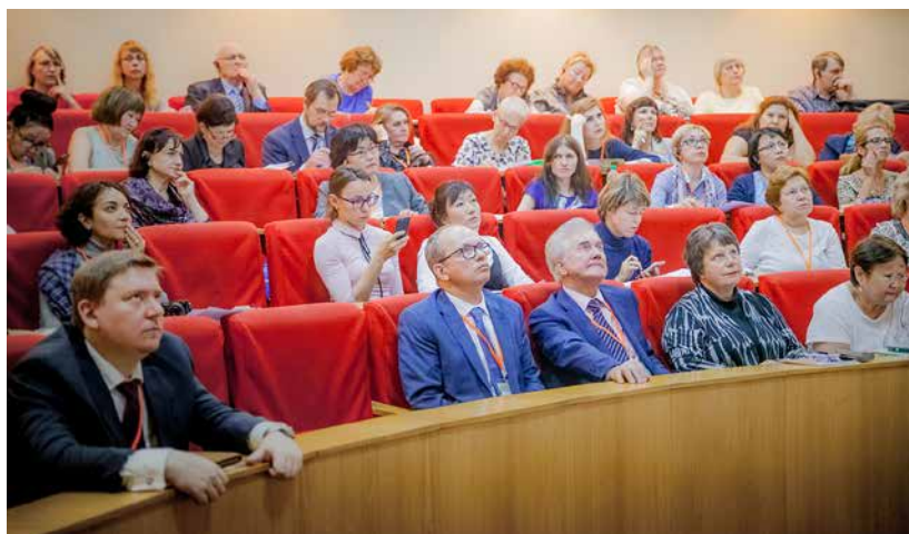
Gastroenterology Board meeting

drugs (NSAIDs), modern possibilities of prophylaxis and early detection of gastric cancer (including the necessity of prompt H. pylori infection eradication), the optimization of endoscopic diagnostic methods (particularly video