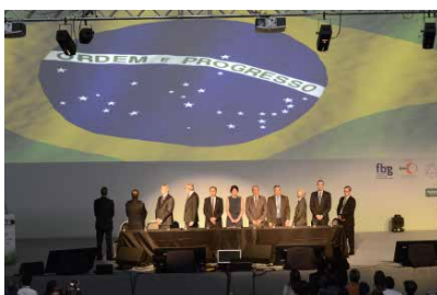
Opening Ceremony - XV Brazilian Digestive Week (SBAD)

President of XV Brazilian Digestive Week President of the Brazilian Federation of Gastroenterology 2015/2016