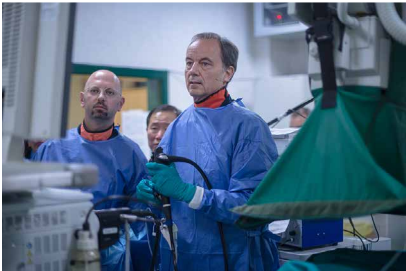
Live video demonstrations

edition of the workshop, and contribute their knowledge and inventiveness to make the live endoscopy sessions remarkable, instructive and stimulating, focusing on the real hot-topics, most recent innovations in diagnostic and interventional endoscopy, including: ERCP, peroral cholangioscopy and pancreatoscopy, endoluminal radiotherapy and treatment of pancreatic cysts, management of gastrointestinal bleeding, endoscopic mucosal resection and submucosal dissection,