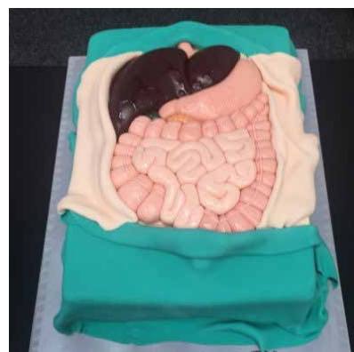
Cake to celebrate 50 years of NZSG

The 50 th anniversary full meeting was fittingly introduced by New