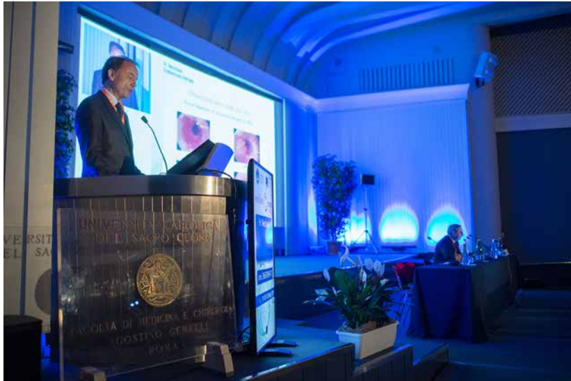
State of the art lectures

radiofrequency ablation of Barrett's esophagus, Peroral Endoscopic Myotomy (POEM) for the management of achalasia, endoscopic cricopharyngeal myotomy for Zenker's diverticulum, diagnostic and therapeutic device, assisted enteroscopy, confocal endomicroscopy and endoscopic ultrasound.