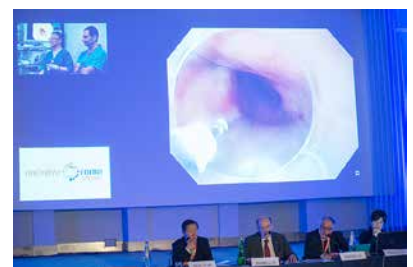
Live transmission in full HD