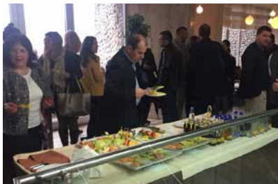
Healthy food and refreshments at break time

remission, it may be sufficient to eat according to the guidelines of a light full diet. But the primary goal is to prevent malnutrition before it starts. Patients with severe diarrhea must assure adequate fluid intake. In very severe inflammatory flares, patients may need to be maintained on parenteral nutrition for several weeks. If possible, nutritional intake through the bowel, either as oral liquid diet or tube feeding, should be preferred to nutrition provided by intravenous infusion.