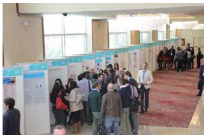
Poster presentations during the meeting

(USA), which prepared 2 postgraduate courses during our meeting.