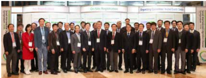
Members of the organizing committee of SIDDS 2016, who are mostly also members of the Korean Society of Gastroenterology

It is our great pleasure to tell you the news that the Seoul International Digestive Disease Symposium 2016 (SIDDS 2016) was successfully hosted by The Korean Society of Gastroenterology with participation of 912 healthcare professionals from 18 countries. The SIDDS symposium is biennial international conference covering hot topics on gastroenterology, and the SIDDS 2016 was held at Grand Hilton Seoul Hotel, Seoul, Korea from November 24th to 25th, 2016, in conjunction with the annual meeting of the Korean Society of Gastroenterology.